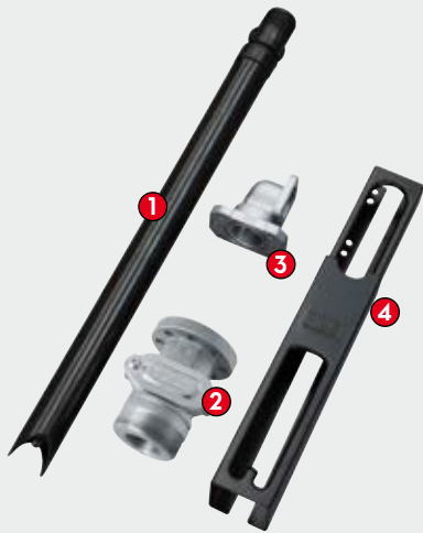
Drum Kit Base Code F16586000