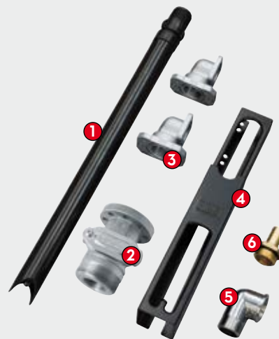
Drum Kit meter/filter Code F16631000